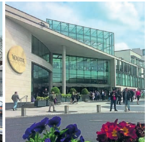
Whitewater Shopping Centre