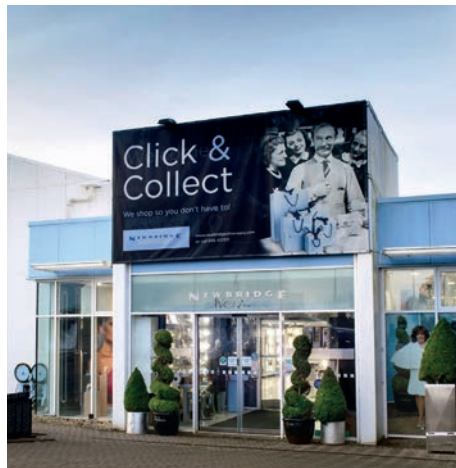
Newbridge Railway Station